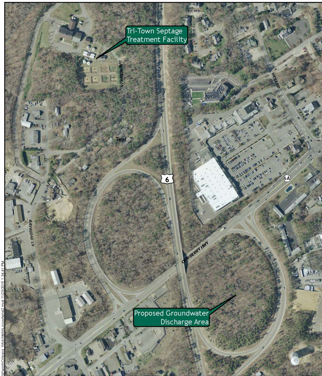
Figure 1 Locus Map Water Quality and Wastewater Planning Route 6 (Interchange 12) Cloverleaf Downtown Area - Groundwater Discharge