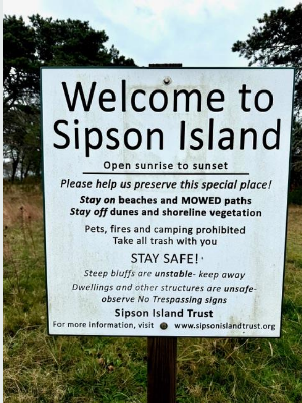
Carved PVC – in place since 2021