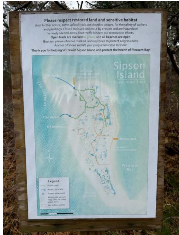
Laminated signs have faded quickly.