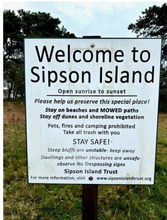
Example of the carved PVC signs, which are the most durable.