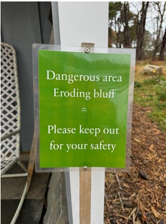
Temporary signs will not last more than one season.