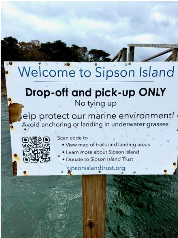
Signs along the water were damaged in storms.