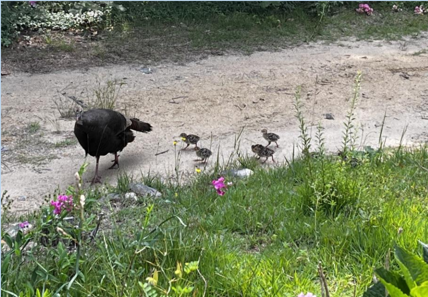
Turkey with poults on site