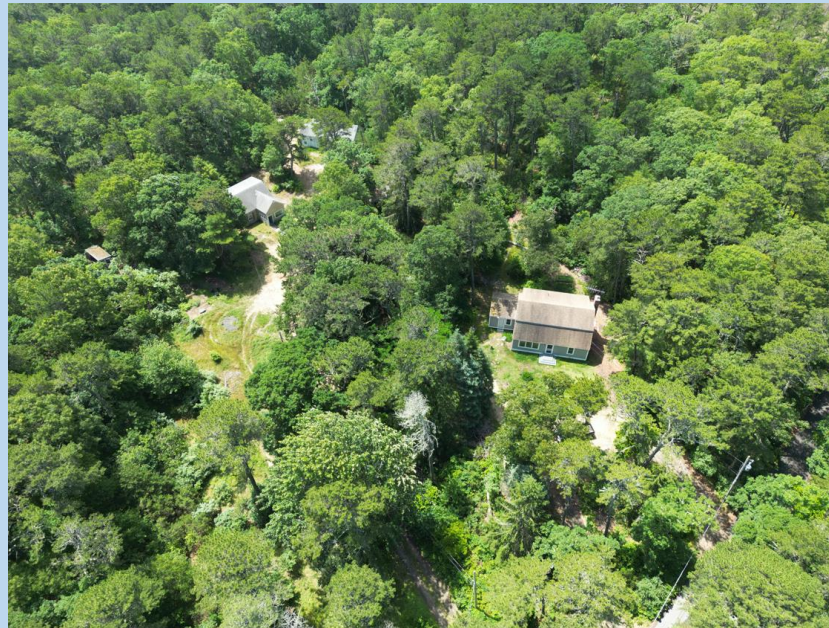
The property is mostly wooded