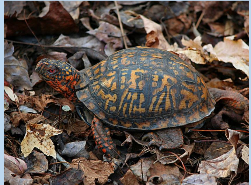
Property serves as eastern box turtle habitat