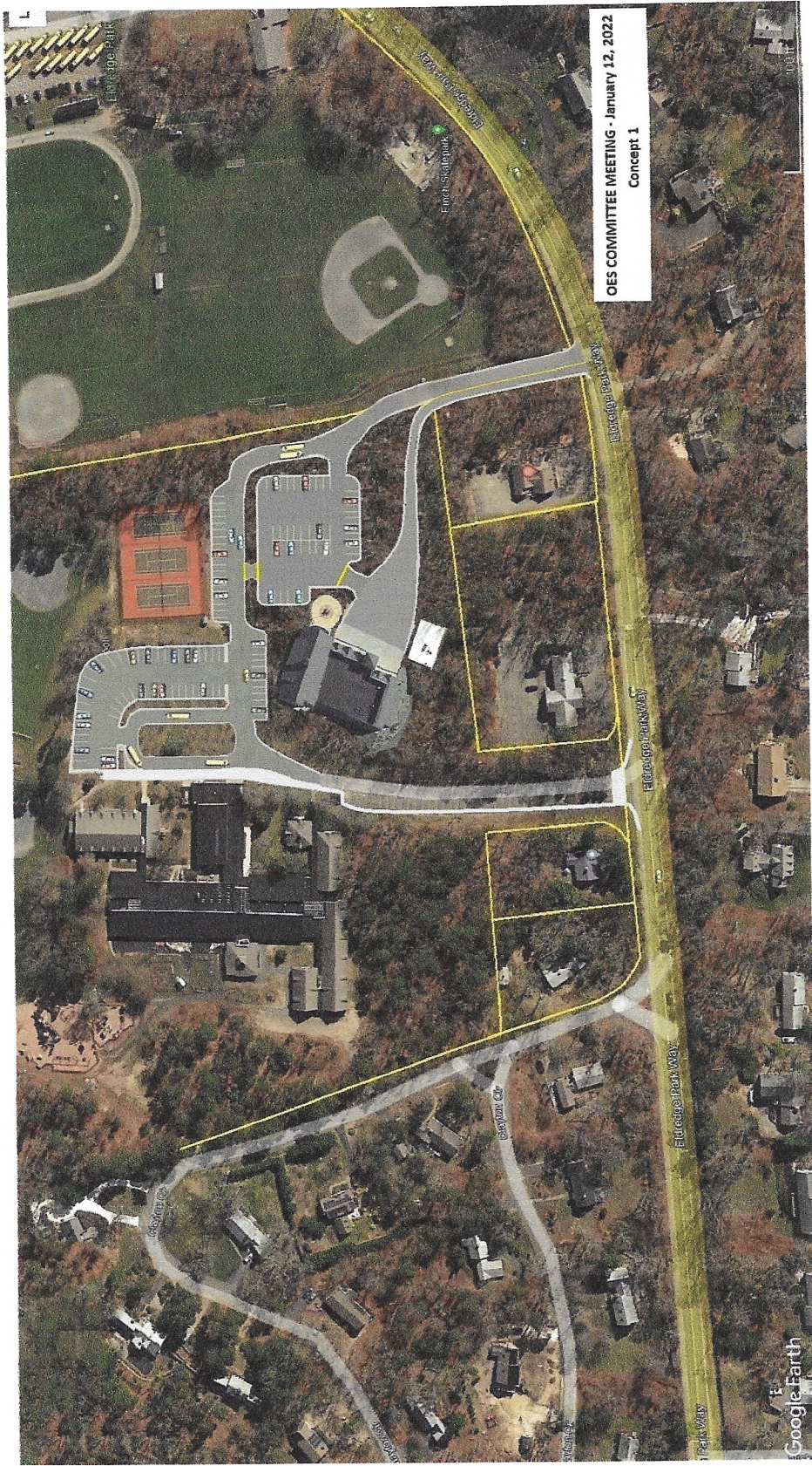
Orleans Elementary School Committee Meeting - January 12, 2022