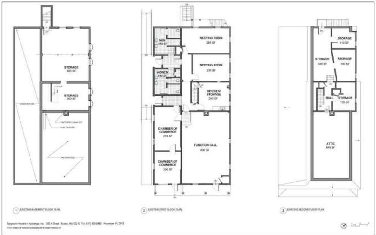
Fig. 1.4. Floor Plans